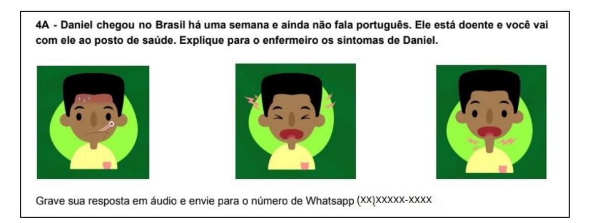
FIGURE 1 - Task 1 (MARCELINO, 2020).

The first task required students to identify three different images of the flu symptoms and record their answers to the task (with their phones or with an audio recorder provided by the researcher<sup>9</sup>). The rubrics of the task were: "Daniel chegou no Brasil há uma semana e ainda não fala português. Ele está doente e você vai com ele ao posto de saúde. Explique para o enfermeiro os sintomas de Daniel."; as presented in FIGURE 1.